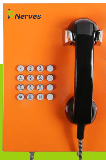
Model No. IPN-10IN