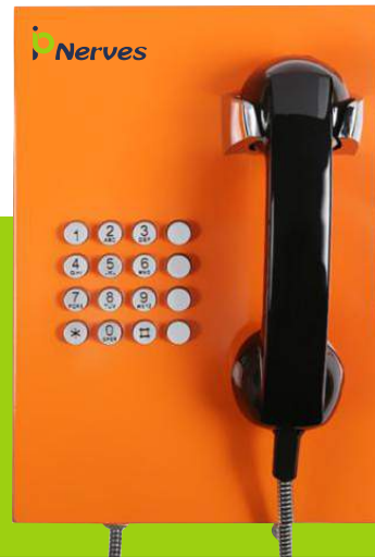
Model No. IPN-10IN